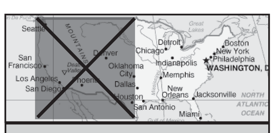
50% of the United States will be off-limits to Humans!

According to the Wildlands Project, "One half of the land area of the 48 conterminous [united] states be encompassed in core [wilderness] reserves and inner corridor zones (essentially extensions of core reserves) within the next few decades.... Half of a region in wilderness is a reasonable guess of what it will take to restore viable populations of large carnivores and natural disturbance regimes, assuming that most of the other 50 percent is managed intelligently as buffer zone." (Noss, 1992) If fully